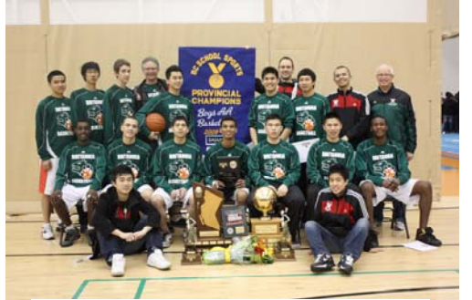
2010 BC AA Boys Champions